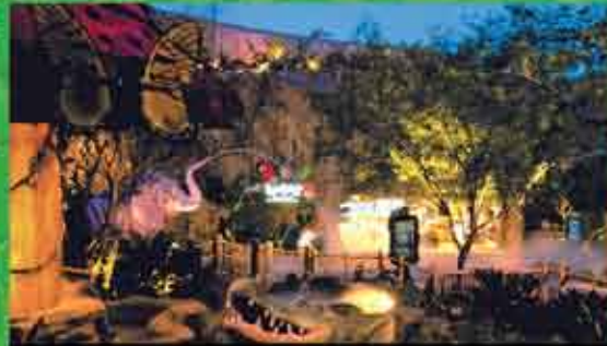
Rainforest Cafe Orlando – Disney's Animal Kingdom®