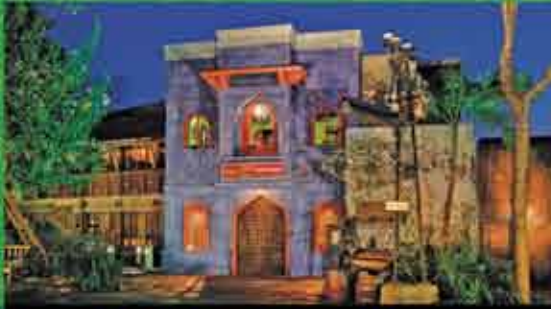
Yak & Yeti – Disney's Animal Kingdom®