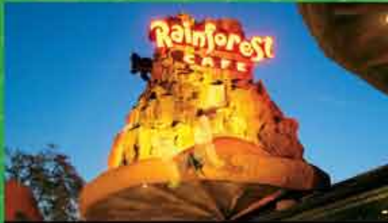
Rainforest Cafe Orlando – Downtown Disney® Marketplace