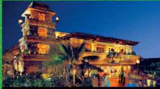
Rainforest Cafe Anaheim – Downtown Disney® District